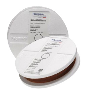
Polymicro Technologies™ Tight-Tolerance Vision System (VS) Flexible Fused Silica Capillary Tubing