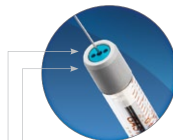
Improved needle hub design for zero carryover Color-coded hub for quick needle volume identification