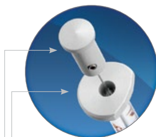
Unique flange design for accurate syringe installation Adjustable button to prevent plunger tip damage